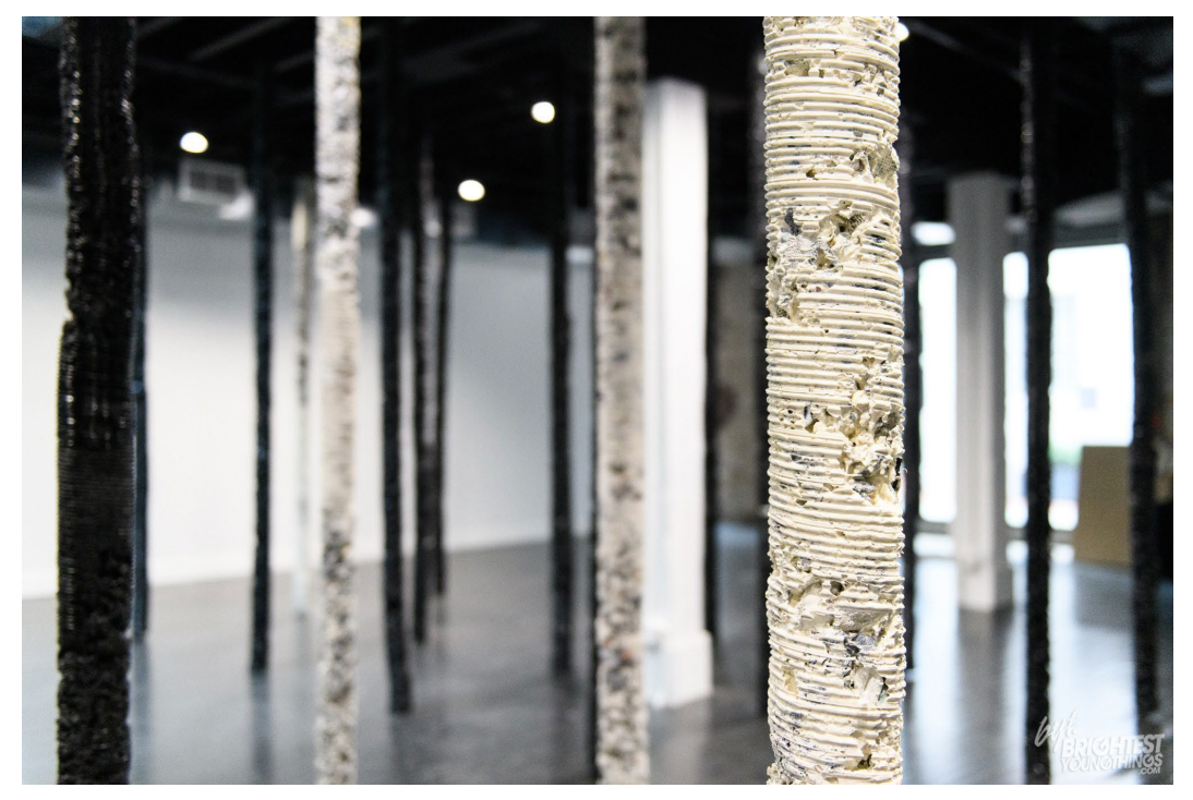
By Kaylee Dugan September 17, 2019

Wander into the Von Ammon Co. art gallery right off of Georgetown's quiet and sun-drenched Cady's Alley and you'll find yourself in a forest. The cracked black and white columns that make up the gallery's newest exhibition resemble gnarled and blackened tree trunks. They're ghostly, spindly, husks of something that once was. Before you can get a sense of exactly what they are (construction components? Giger-esque alien technology? Salvage from some unknown urban blight?), there's a sense of metamorphoses. Surely these columns weren't created from nothing, they feel like the imprint of a much larger beast. They look like survivors.