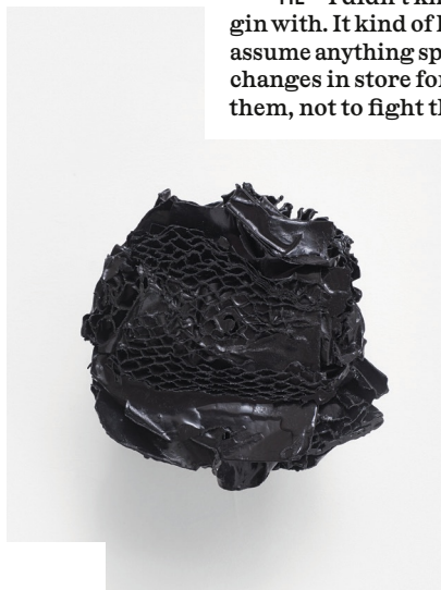
Some of Helmut Lang's works, shown at an exhibition in Vienna.

HL I didn't know that I'd end up in fashion, to begin with. It kind of happened to me and I never tried to assume anything specific for the future. Life always had changes in store for me and I have learned to embrace them, not to fight them, but give it my best.