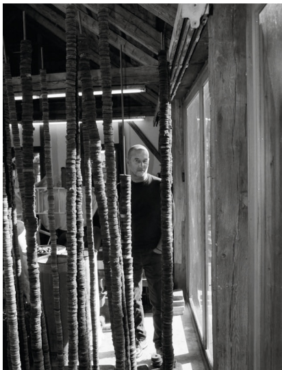
Helmut Lang in his studio. The artist has devoted himself to sculpture for the last ten years.